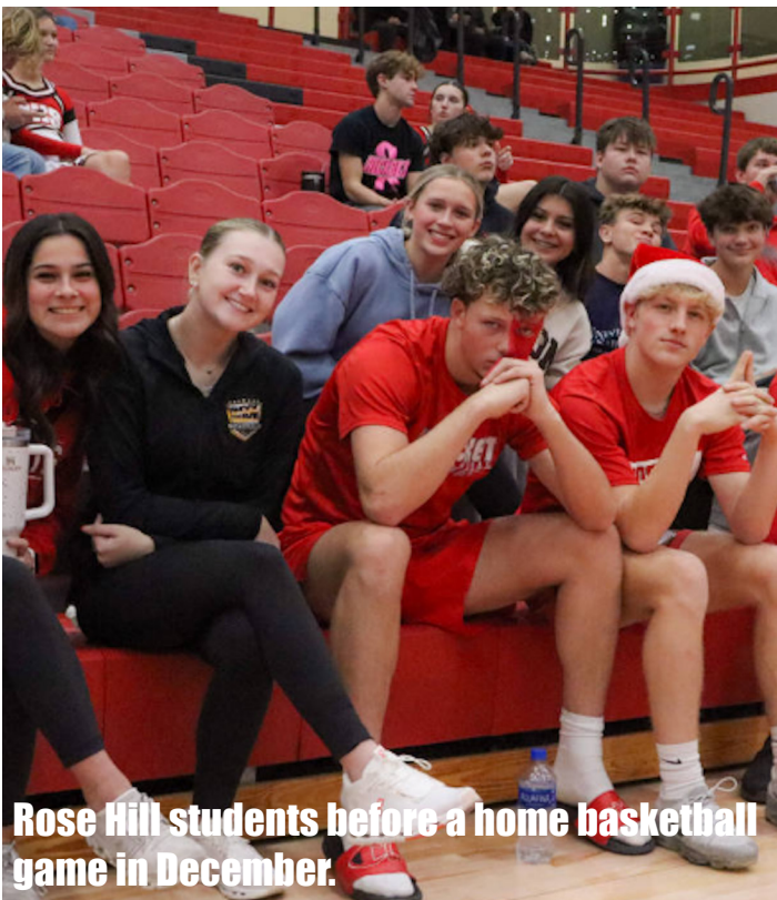
Rose Hill students before a home basketball game in December.