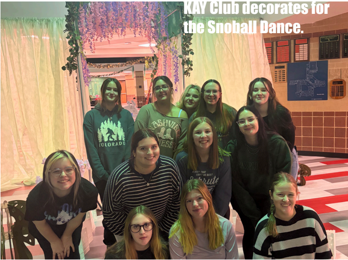
KAY Club decorates for the Snoball Dance.