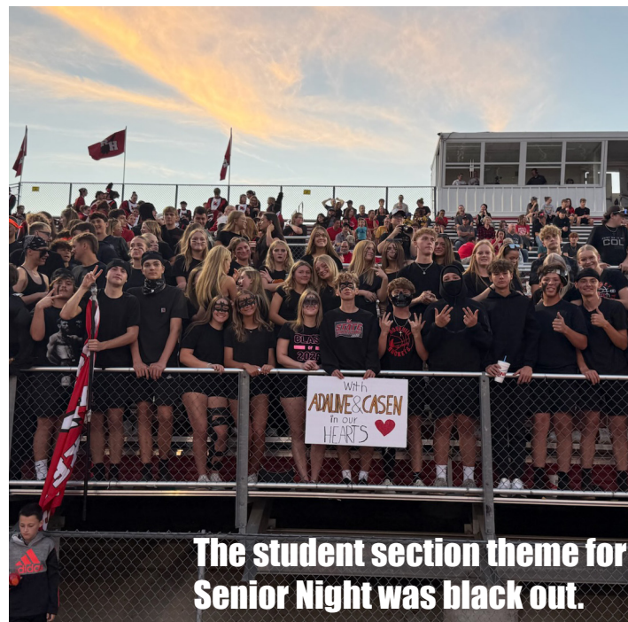
The student section theme for Senior Night was black out.