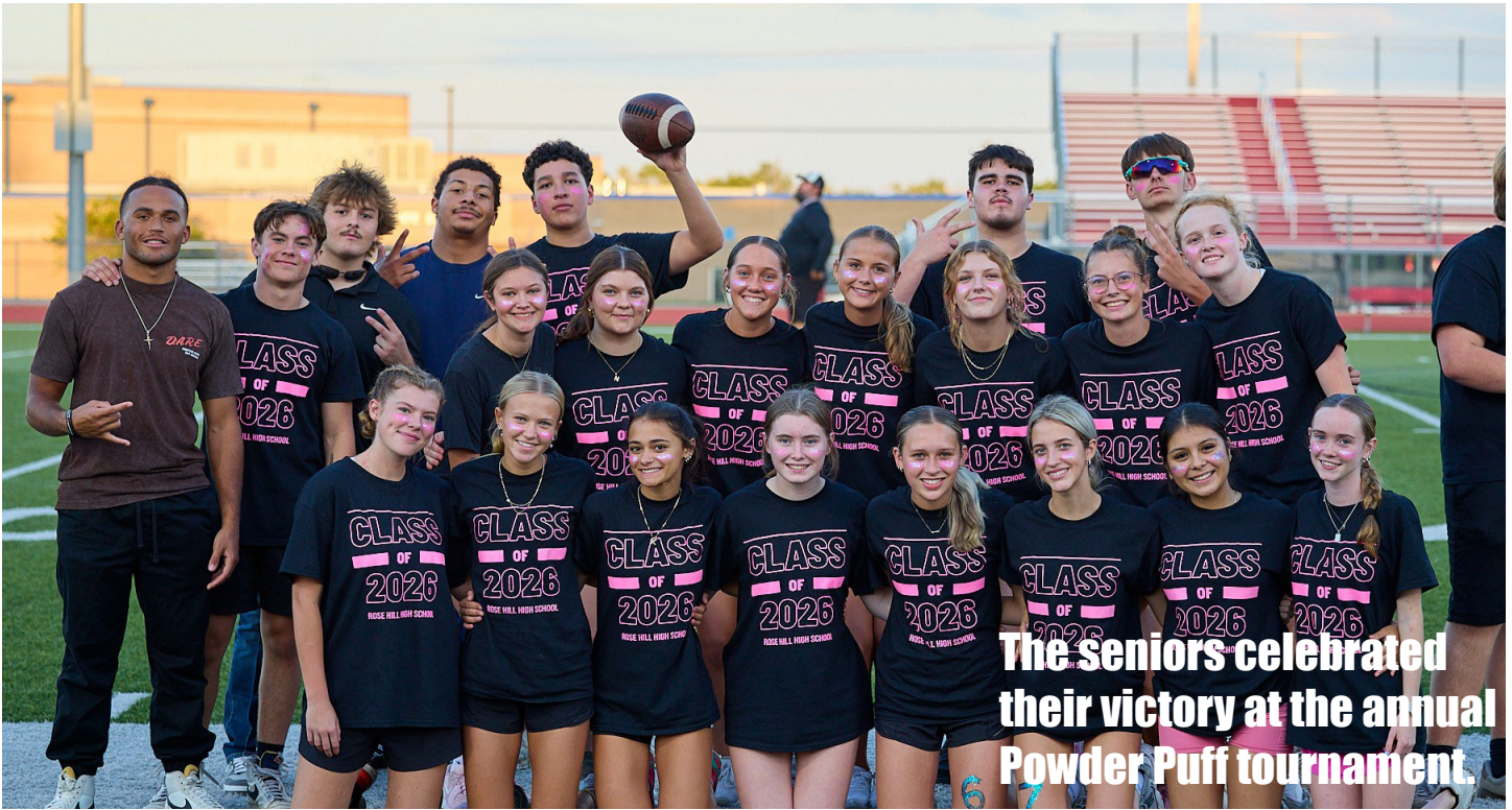
The seniors celebrated their victory at the annual Powder Puff tournament.