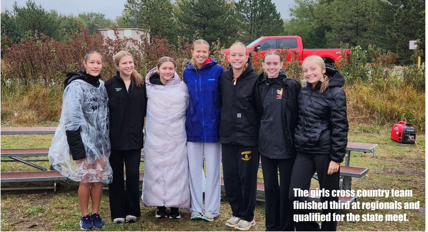
The girls cross country team finished third at regionals and qualified for the state meet.