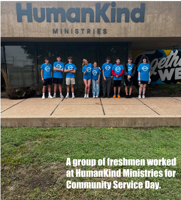
A group of freshmen worked at HumanKind Ministries for Community Service Day.